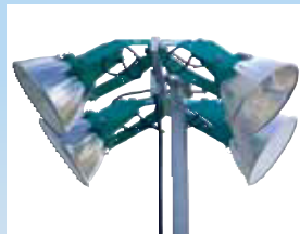
Each lamp can be set to any direction